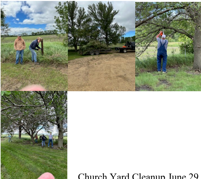
Church Yard Cleanup June 29

FAITH is like Wi-Fi, it's invisible but it has the power to connect you to what you need.